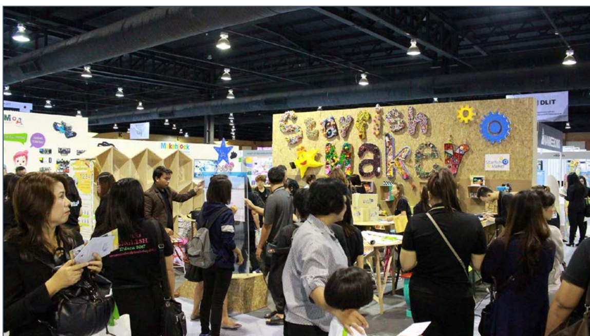
EDUCA attendees visiting the Starfish Maker display in October of 2017

Another component of project activities for Starfish Maker in the 2017-2018 fiscal year involved promotional events and exhibitions that aimed to raise awareness among schools and organizations that had not yet heard of the Makerspace concept. This is integral to expanding training and development to more schools, educators and students in the upcoming year.