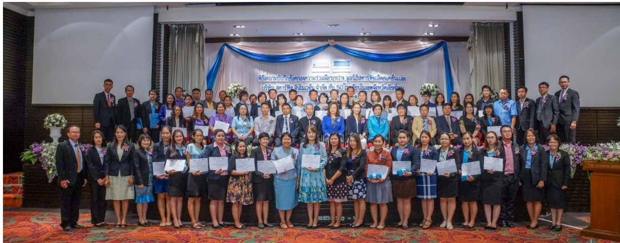
Participants of MOU signing ceremony to expand Starfish Maker to government schools in Chiang Mai, Thailand. August 2018

With this in mind, several memorandum of agreements were signed between SEF and educational entities at the provincial government level to begin work on teacher professional development and implementation for new Makerspace sites at Thai public schools. As of September 2018, work has begun to set up Makerspaces at 50 schools in Chiang Mai province, 4 schools in Chiang Rai province, and 10 schools in the greater Bangkok area.