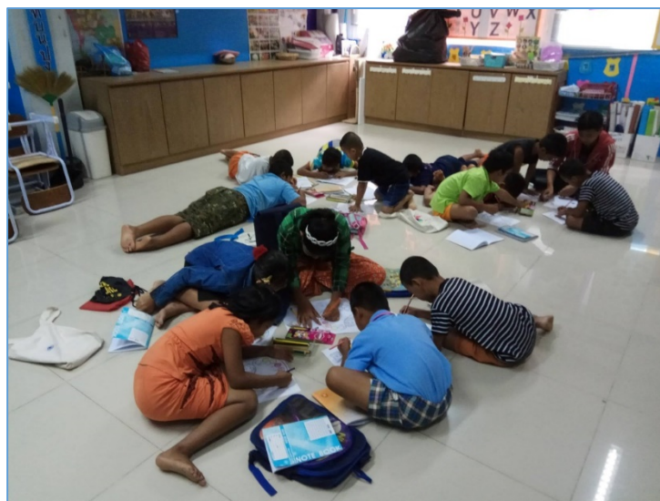
Children from the local community participate in weekend activities at Life Prep

The daycare program included basic education subjects such as Thai language and mathematics, with Burmese language classes also being incorporated this year. Additionally, children used Project Based Learning curriculum in their classrooms on a weekly basis.