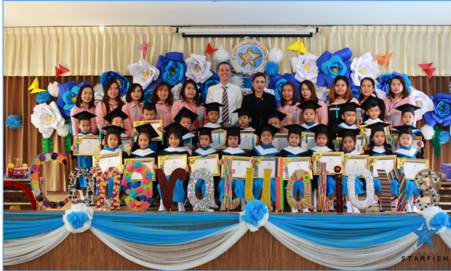
Graduation ceremony for the final class to attend Starfish Learning Center

Meanwhile, the LifePrep program's main focus was to provide education and protection for migrant children and other marginalized groups in the factory area of Mahachai, where large numbers of economic migrants both live and work.