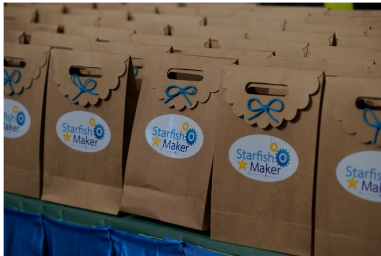
Starfish Maker Kits that are distributed to exhibition participants

Maker display at the annual Private School Conference in Chiang Mai. This conference draws educators and students from private schools all around Northern Thailand.